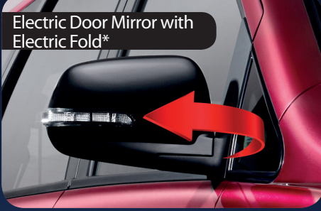
Electric Door Mirror with Electric Fold*