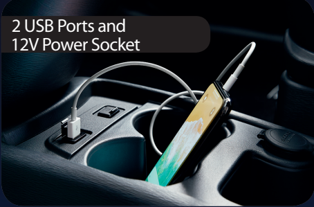
2 USB Ports and 12V Power Socket