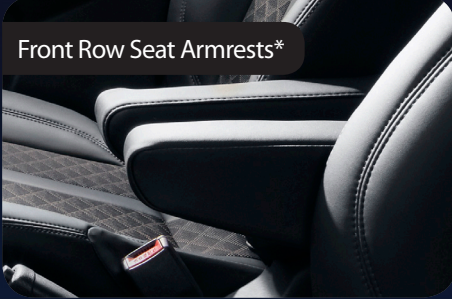
Front Row Seat Armrests*