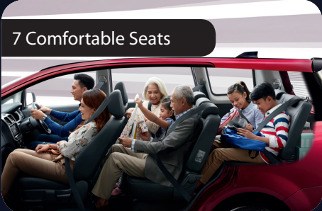
7 Comfortable Seats

To us, space equates to luxury and practicality and the 2019 EXORA has both. No wonder it's listed in the Malaysia Book of Records having set the record for "Most People in an MPV" making it an excellent choice for comfort no matter how long the journey.