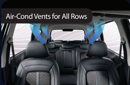
Air-Cond Vents for All Rows